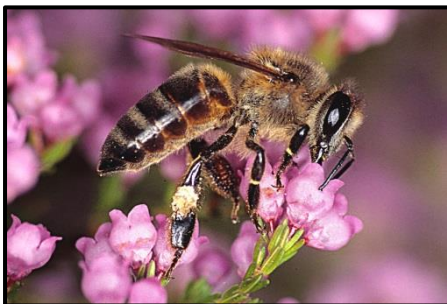
Honey bee on a fynbos Erica sp

Indigenous plant species that stand out as important forage for South African beekeepers include: fynbos plant species (e.g. ericas, proteas and mesembs), several species of aloe (including mountain aloe), shrubs like wild asparagus and buchus, and indigenous trees such as Vachellia karroo (sweet thorn) and Ziziphus mucronata (buffalo thorn). Many regional vegetation types are also vitally important to beekeepers.